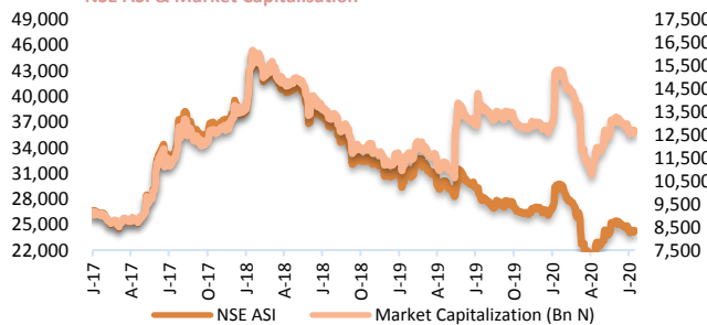
NSE ASI & Market Capitalisation

The local bourse All Share Index (ASI) rose marginally by 0.03% to close at 30,741.88 points amid sustained bargain hunting activity even as the Exchange printed 13 gainers as against 11 losers at the close of the trading session. Hence, the year to date gain of the NSE ASI climbed to 14.52%. Specifically, Tickers such as CAP, FCMB, GUARANTY and WAPCO closed higher by 314%, 5.17%, 0.31% and 0.27% respectively amid demand pressure. Of the five indices tracked, three closed in green while the rest closed flat. The NSE Insurance, NSE Consumer Goods and NSE Industrial indices rose by 1.04%, 0.05% and 0.03% respectively while the NSE Banking and NSE Oil/Gas closed flat. Meanwhile, market activity waned as the total volume and value of stocks traded fell by 14.77% and 20.45% to 0.28 billion unit and N3.0 billion respectively. Elsewhere, NIBOR fell for all tenor buckets amid renewed liquidity ease; also, NITTY moderated for most maturities tracked amid demand pressure. In the OTC bonds market, the values of FGN bonds moved in mixed directions across maturities tracked; however, FGN Eurobond rose for all maturities tracked.